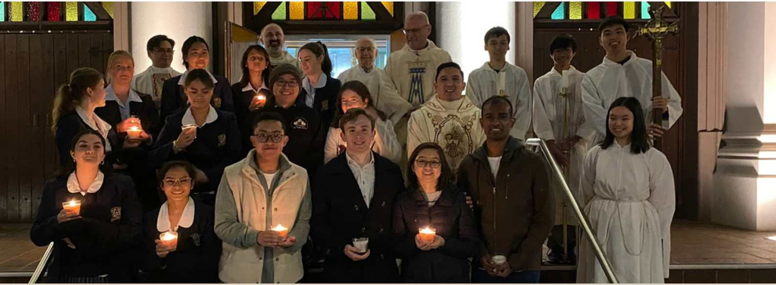
Wednesday's Pilgrim Commissioning to World Youth Day was a beautiful celebration and send off for our parish and Mercy College pilgrims.